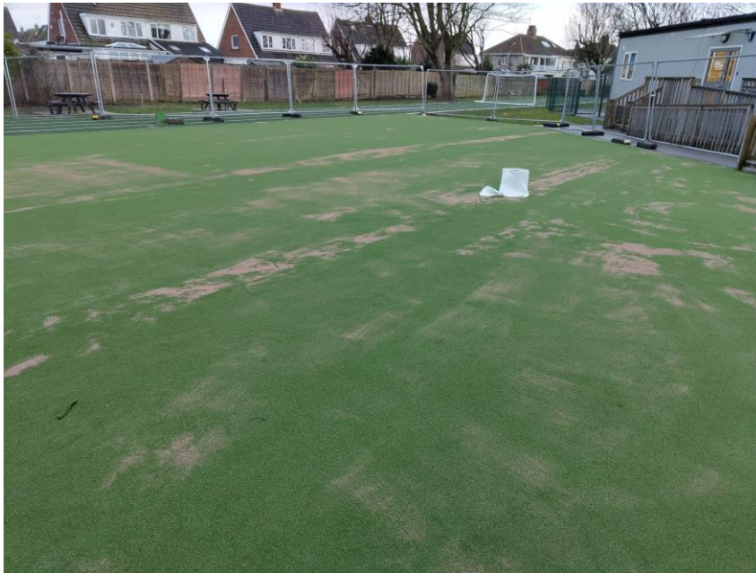
W6 New Flooring