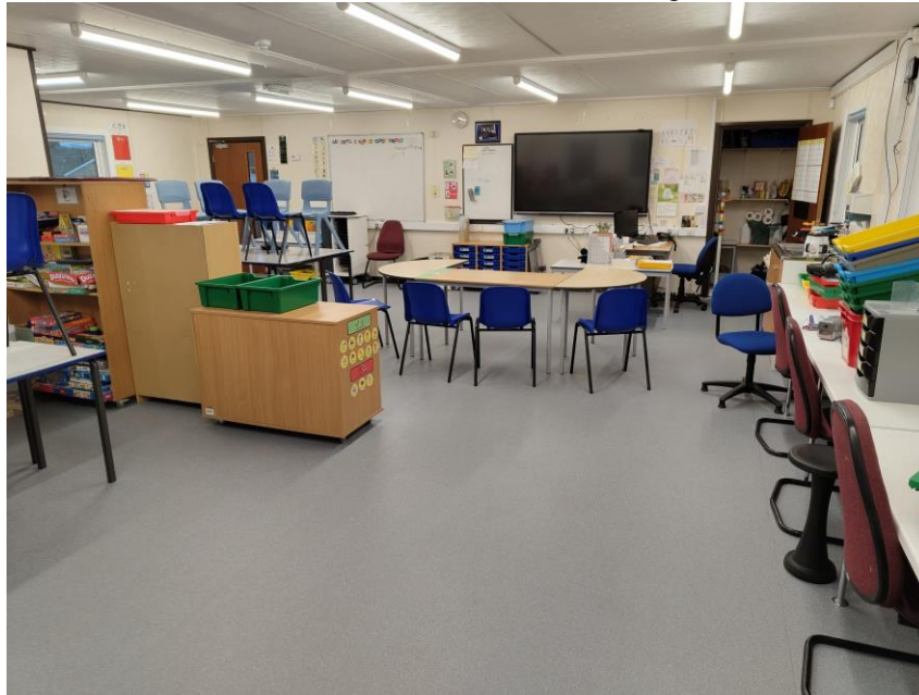
Bath Class – New Air-Con