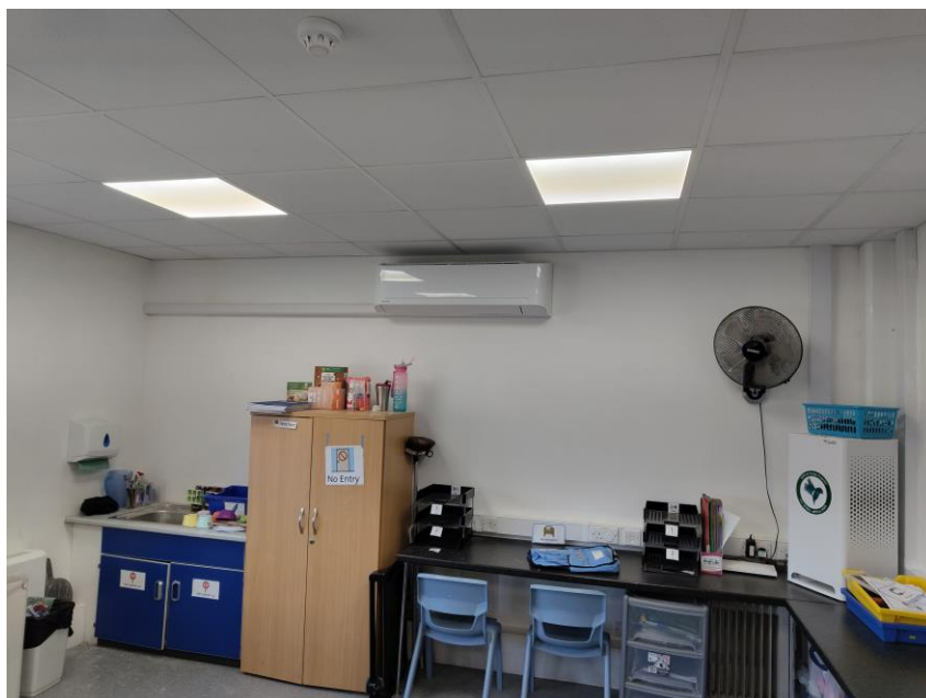
Wells Class – New Air-Con